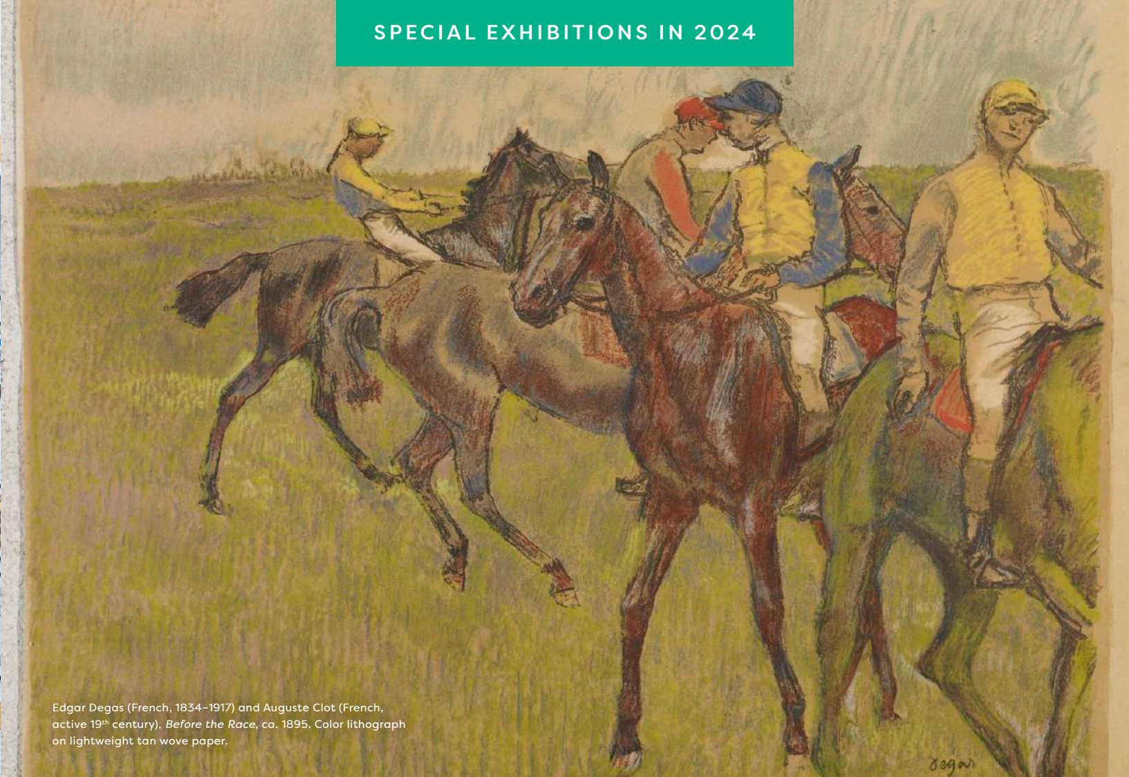
Edgar Degas (French, 1834–1917) and Auguste Clot (French, active 19 th century), Before the Race , ca. 1895. Color lithograph on lightweight tan wove paper.