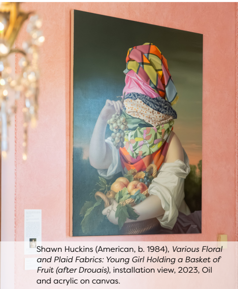
Shawn Huckins (American, b. 1984), Various Floral and Plaid Fabrics: Young Girl Holding a Basket of Fruit (after Drouais) , installation view, 2023, Oil and acrylic on canvas.