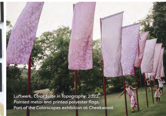
Luftwerk, Color Suite in Topography , 2022, Painted metal and printed polyester flags. Part of the Colorscales exhibition at Cheekwood.