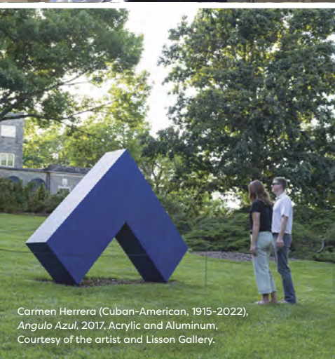
Carimen Herrera (Cuban-American, 1915–2022), Angulo Azul , 2017, Acrylic and Aluminum, Courtesy of the artist and Lisson Gallery.

Community Passports give NPL cardholders free admission to community attractions and services. The Cheekwood passport provides free general admission for up to two adults and two children, with additional youth available at half price.