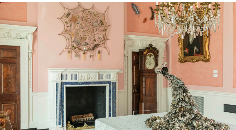
Ann Carrington, Bloomstruck , 2023, silver, nickel and steel plated cutlery.